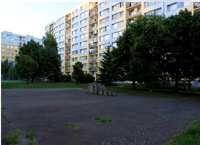
Inner courtyard before revitalization

Situated on the south from the centre of Prague city centre, Prague 11, one of the fifty seven quarters of the capital, has nearly 80.000 inhabitants. The majority of them have been living in high-rise blocks of flats, built in the 1970s and 1980s. Obviously, these housings estates have become obsolete and in recent years have been subject to renovation and revitalization to enhance their residents' living conditions from environmental, economical as well as aesthetic points of view.