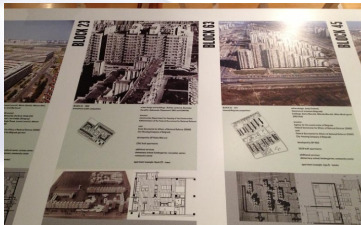
Exhibition Unfinished Modernisations