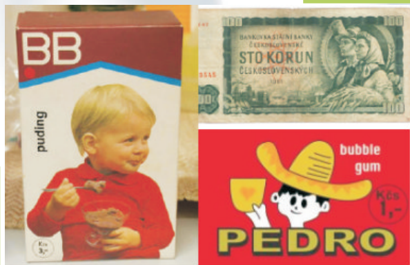
Examples of museum exhibits

The building, which is planned to be a museum, was built in 1985 by the citizens of Hnusta in frame of the program known as "Action Z", that is an action, where the citizens work on the building for free. Therefore the building is of great memorial value. It was primarily constructed as a grocery store for people living in the suburbs of Hnusta city – which offered supply of food without the need to travel to the center – core of the city. Nowadays there is no interest in investing in the building and it is therefore in the state of proceeding deterioration.