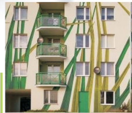
A good example of the facade renovation

Currently more and more large housing estates constructed in the socialist period in Poland are a subject of small-scale refurbishment and revitalization. The process is usually driven by housing cooperatives, and, in most cases, it refers to buildings' insulation and restoration of the facades.