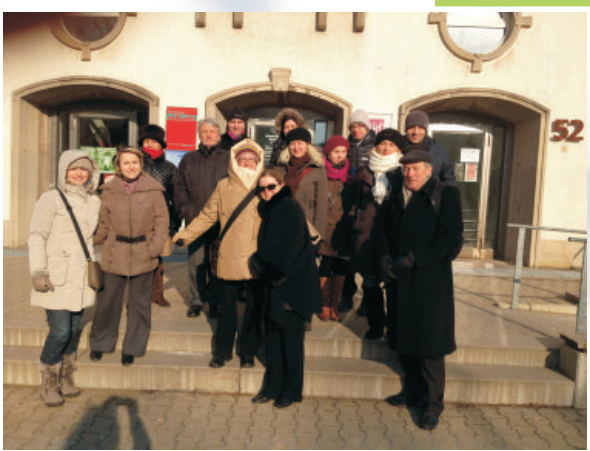
ReNewTown Team in Karlsruhe