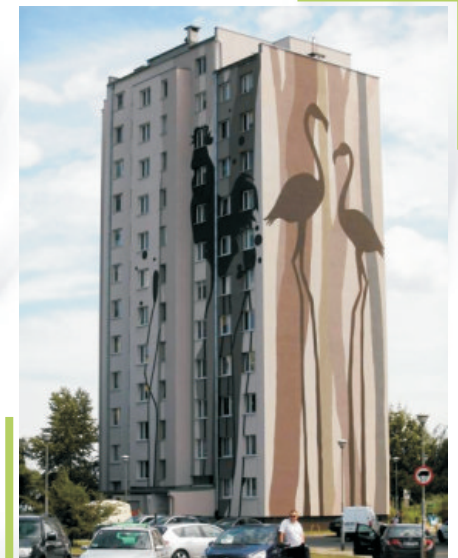
A good example of the facade renovation

The 'Pospolite Ruszenie' is a bottom-up initiative, which was created in 2011 by two young Polish artists L.U.C and Sokół. Its aim is to 'defeat the ugliness of post-communist public space in Poland' i.e. the gloomy, socialist realist housing estates and kitsch motley tower blocks and, consequently, regain the space from post-soviet indifference and passivity.