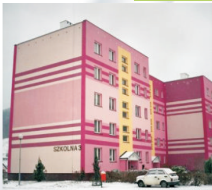
A bad example of the facade renovation

One of the fundamental problems of large housing estates of the socialist period is their ugliness, monotony and architectural monumentality.