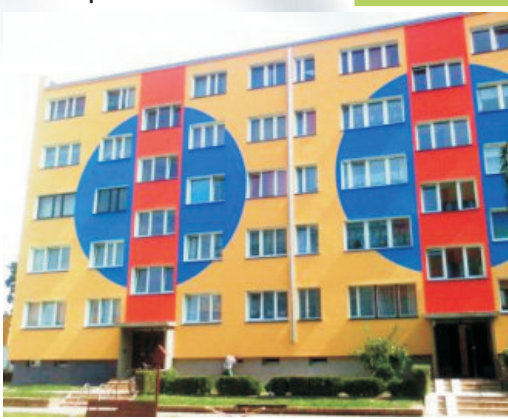
A bad example of the facade renovation

Unfortunately, the process occurs without a coherent strategy, often with strange colors of facades that transform Polish cities into patchy and aesthetically destroyed areas. The 'Mass Movement' (Pospolite Ruszenie) initiative aims to increase public awareness of this problem and to refurbish as many buildings as it is possible in order to change the image of the urban landscape in Poland.