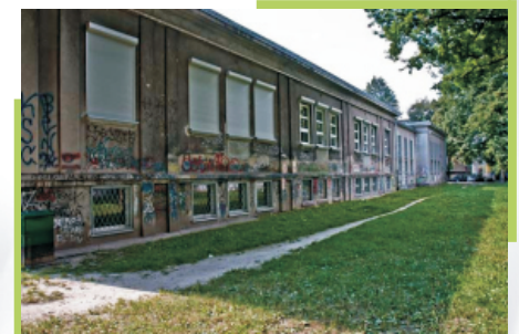
Nowa Huta in Cracow, Poland