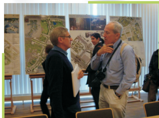
Meeting in Ursynów District Office