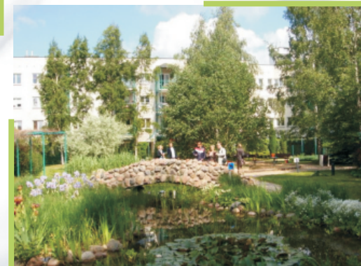
Backyard garden, Ursynów district