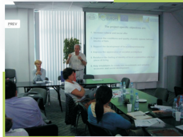
ReNewTown technical meeting