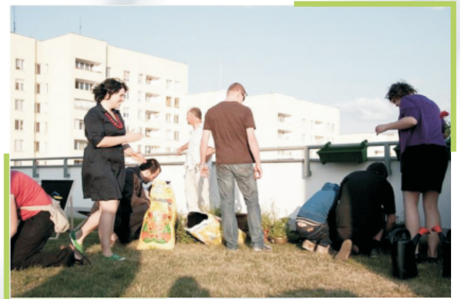
'Afternoon on the roof' workshop

Within the framework of the project, conferences, workshops and happenings are planned to be organized by artists, urban planners and cultural animators. This approach will provide the creative means of involving Targówek's diverse residents in the process of adapting and transforming the community's fabric. The conference opening the project was organized on June 17-18. During the conference one of the most interesting workshop was the: 'Afternoon on the roof' which aimed to show possibilities to develop housing or recreational function on the roof of typical socialist housing blocks.